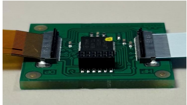
FIGURE 1 07320200 Connector Board with open ribbon cable clamps